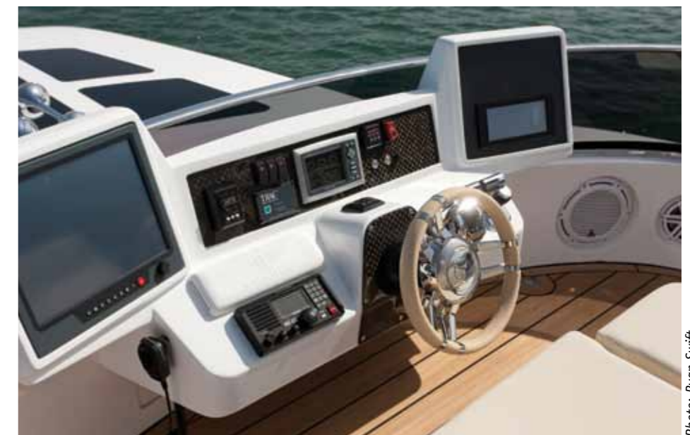
Top: The NISI 2400 at speed; Above: the flybridge helm.

“The fine entry at the bow enables NISI to cut through moderate waves without disturbing the cocktails”