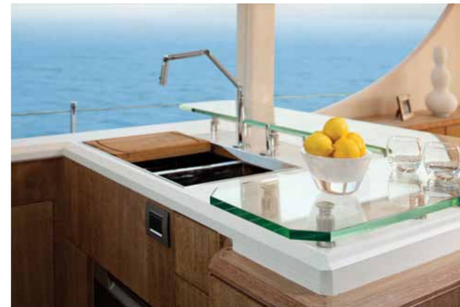
The galley station on the main deck is very open and shares space with the rest of the yacht.

Up at main deck level the main part of the saloon is given over to a combined lounge/dining area that is fitted with a rising table. The whole of this deck saloon is surrounded by large square windows and subdued strip