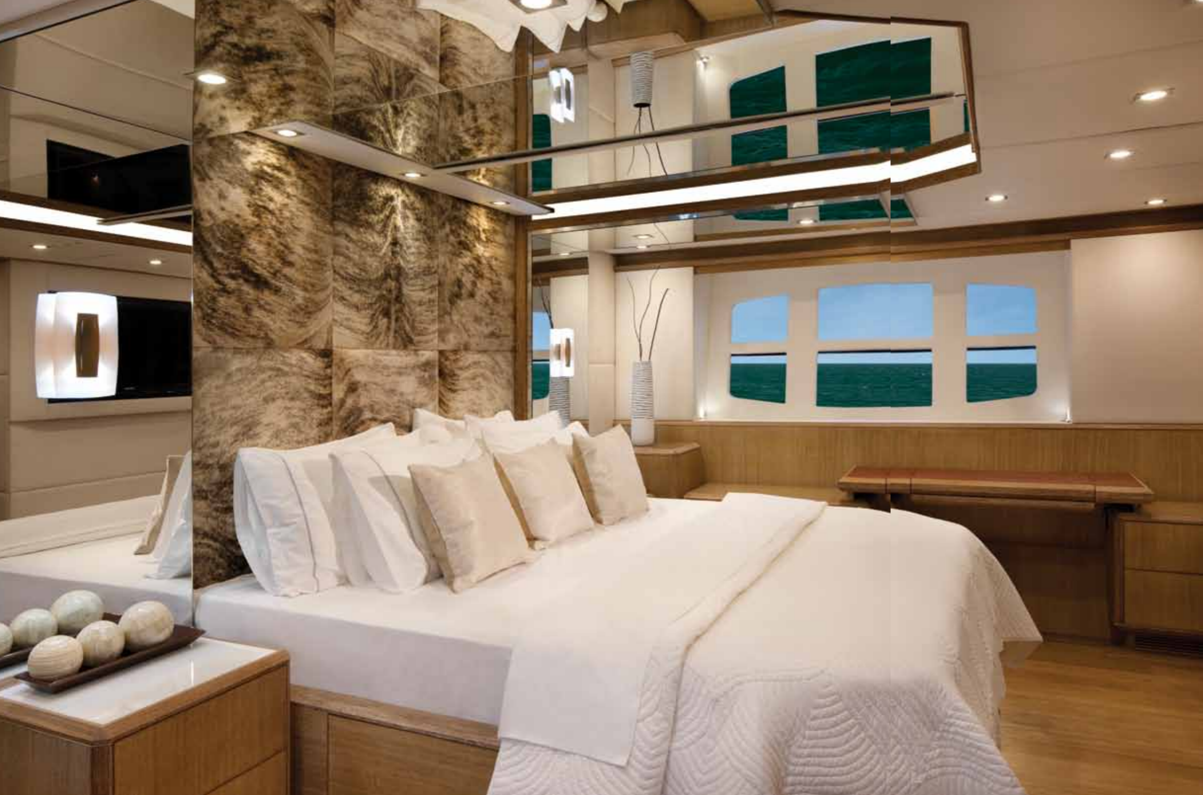
The master cabin – tasteful and brightly lit.

lights run the length of the saloon and extend out into the cockpit overhang to link the two areas together. This link is also made by the automatic sliding doors that move in an eerily quiet automated way, another one of the dedicated design features that are seen throughout NISI.